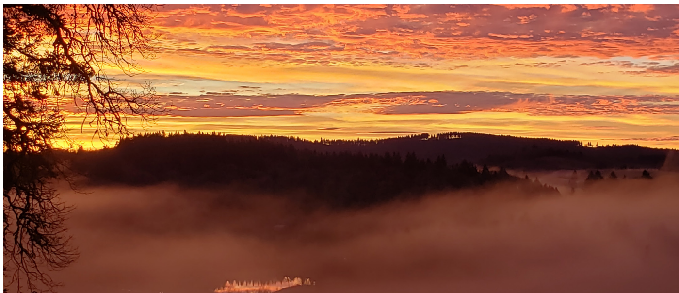
Dawn breaking at Doe Ridge Estate Vineyard

wine selections will vary based on your club shipment preference