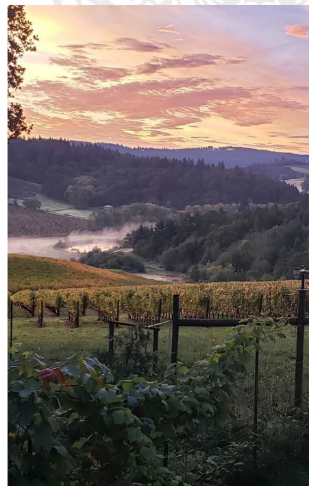
Stunning sunrise at the top of Doe Ridge Vineyard in Dundee Hills AVA. Heaven on earth.